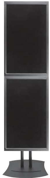
Two stacked screens or four screen formation requires accessory dual screen cartridge (ACC604)

ACCESSORY Screen specific adapter plate (PLP models) Universal screen adapter plate (PLP-UN-1) Additional dual screen cartridge (ACC604)