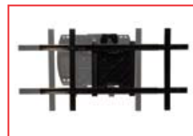
10.75" of horizontal adjustment