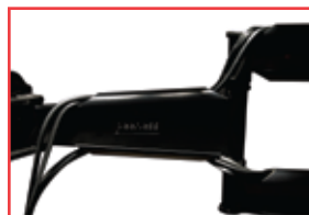
U-Groove covers provide 1" clearance for cables